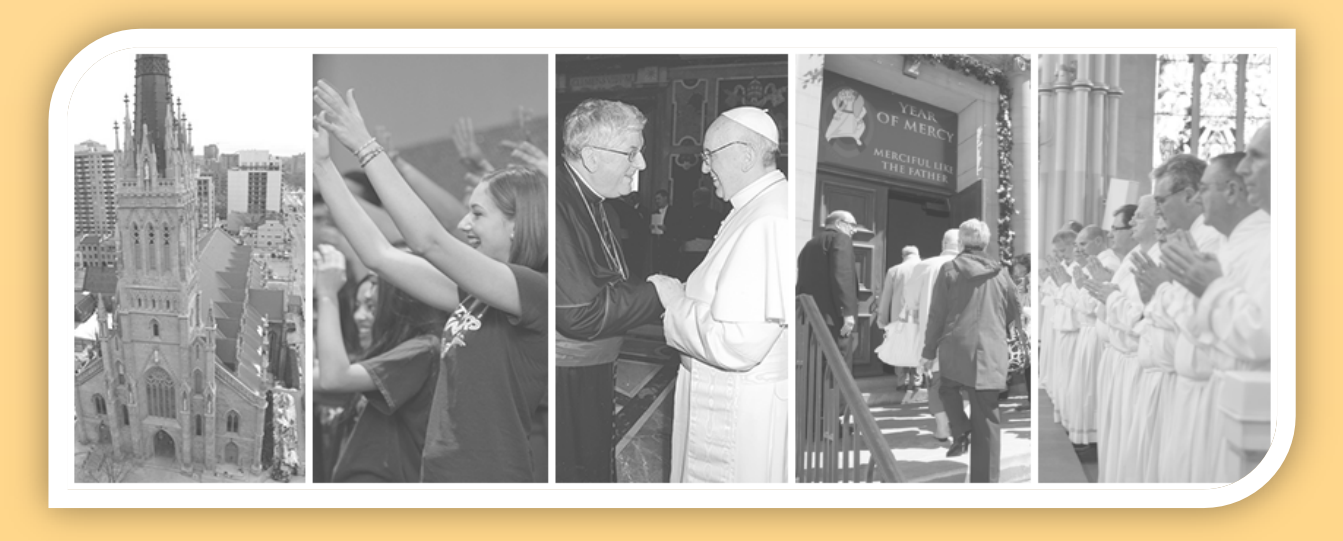
Volunteer Application Form - Parish-based Ministry Positions Adults 18+ in General Risk Positions